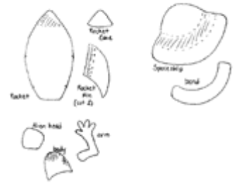
Makin's Clay alien invasion scrapbook page - line drawing patterns

2. For Planets: to marble clay, take the clay colors you want and roll into ropes. Twist the ropes together and slightly blend the clay together to marble it. Stop when you like the way it looks. Roll clay flat and cut with circle cutter. Leave plain, texture with texture sheet or make craters using chisel tool.